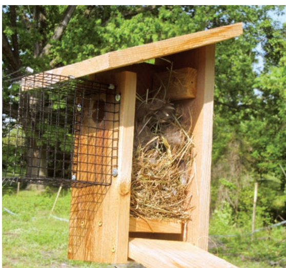
Nissley and Stauffer found a house sparrow nest in a bluebird box at AHS on May 3.