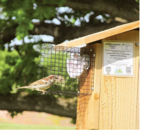
Within minutes of plugging the box's entrance, this house sparrow arrived with nesting