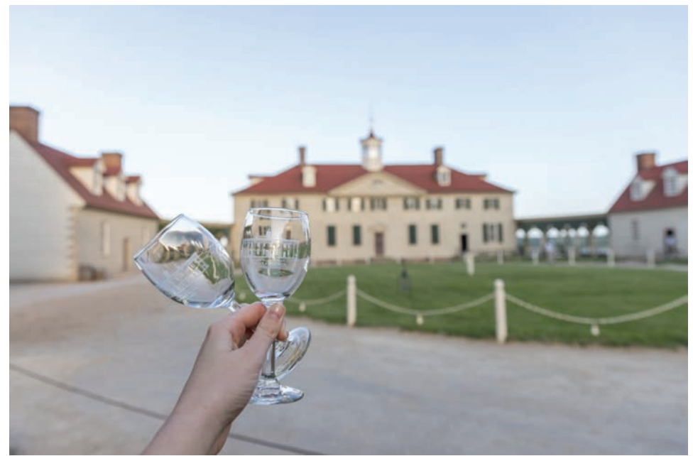
The Mount Vernon Wine Festival takes place May 17-19, 2024 at George Washington's Mount Vernon Estate.