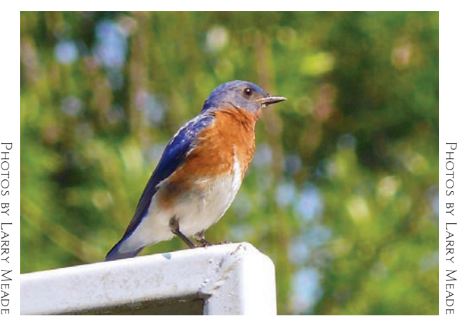
Local Volunteers Boost Bluebirds, Monitor Nestboxes