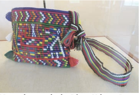
Mayan bag made, by Diego Velasco Perez

In the two decades before the Civil War, free Black families such as the Hollands pur-