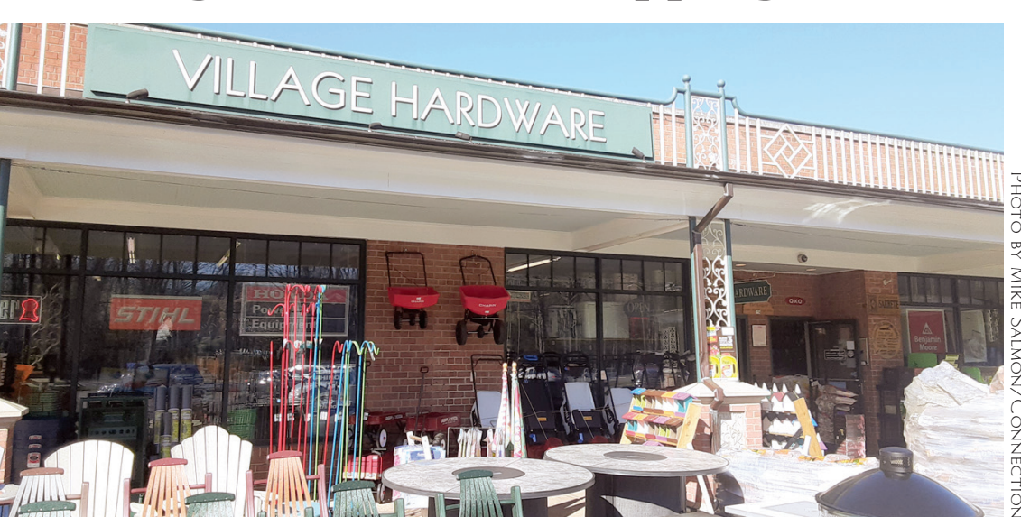
The Village Hardware changed hands a few years ago and continues to thrive and serve the community.