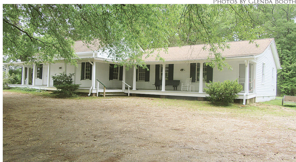
The Alexandria Friends Quaker Meeting at Woodlawn today