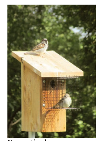
Non-native house sparrows are tough competitors for bluebird nest boxes, like these at AHS on May 3.

I agree with the Governor when he mentioned earlier this week that this budget must be a good compromise if everyone is a little unhappy with the outcome.