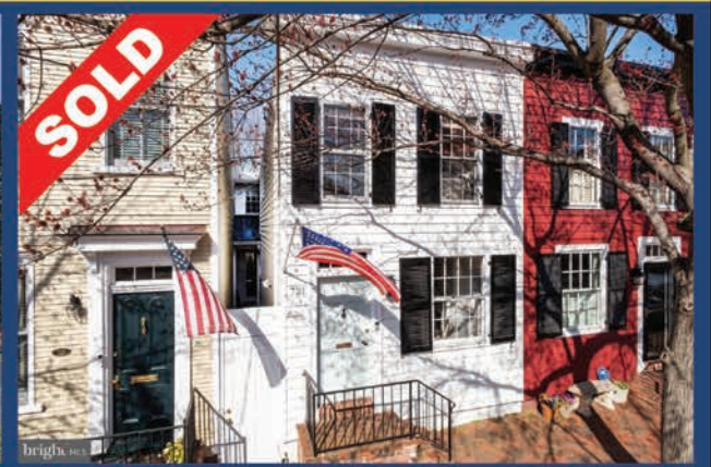
721 S. Lee St | $1,995,000