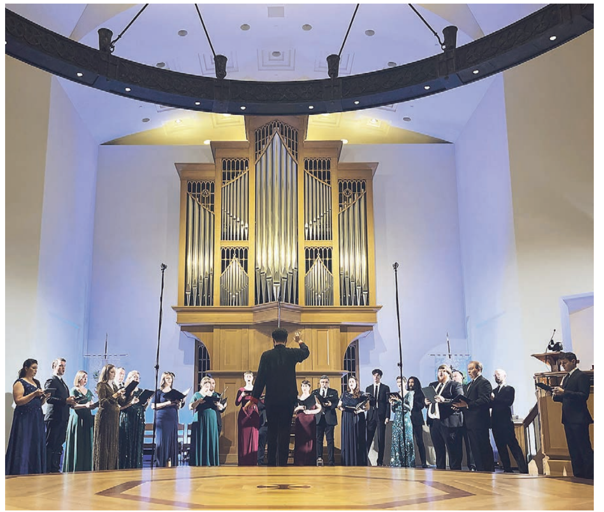
The Thirteen: Beautiful as the Sky will be performed on Friday, May 17, 2024 at Washington Street UMC in Alexandria.