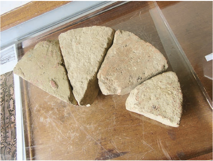
Bricks made by enslaved people for Woodlawn's front

Also exhibited is a grindstone and stone www.ConnectionNewspapers.com