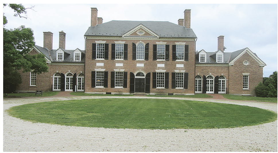
The Woodlawn mansion today