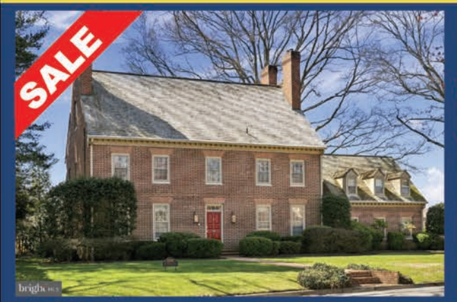
9394 Mount Vernon Cir | $1,875,000

"Hamilton" model consists of over 5,500 total sq ft on 3 levels. Wakefield homes, one of the area's premier custom home builders has provided an impressive long list of included features/options. Pre-construction purchase provides opportunity to customize and make it a home with your personal touch! Delivery of first home (lot 10) anticipated to be the end of 2024. Incredibly rare opportunity for new construction on large level lot in prime Mount Vernon location!