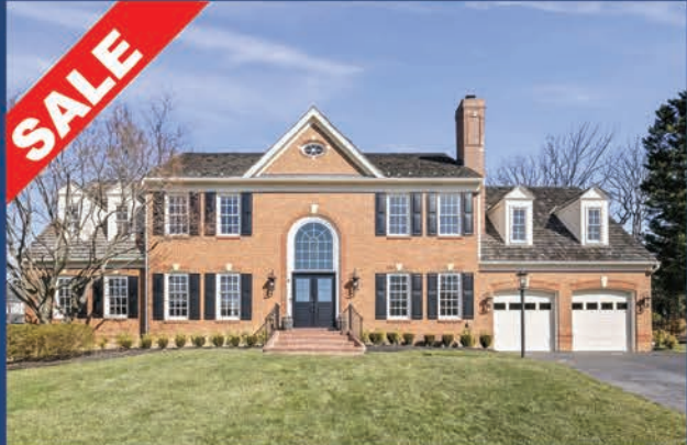
9387 Warburton Ct | $1,899,000